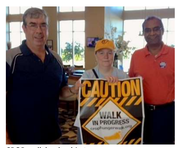
CROP walk leadership team