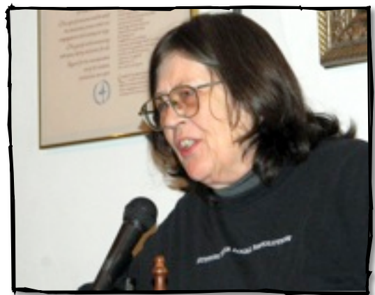
A few of the Charlot Martin Players working hard in 2015...