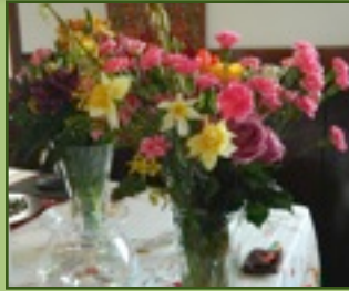
MARCH 2016 NEWSLETTER