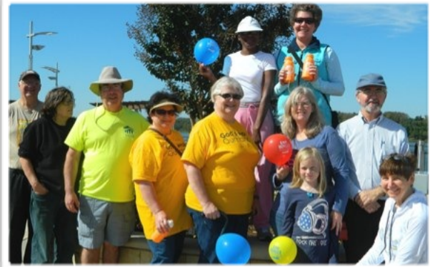
The gang @ CROP Walk 2015

God of the Autumn, help us to see in the ways of nature