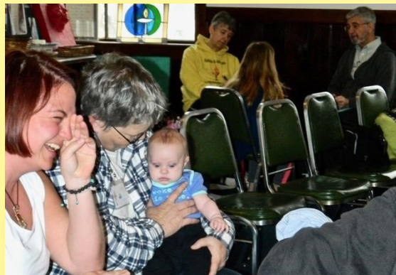
What's so funny?