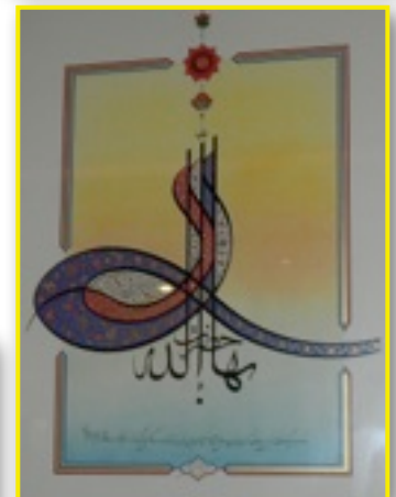
Calligraphy of God's Name Baha'i Center of Louisville