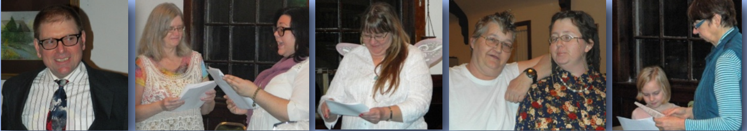
Highlights from MLK Coffeehouse 2016