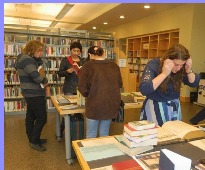
Faith Fest Sacred Texts