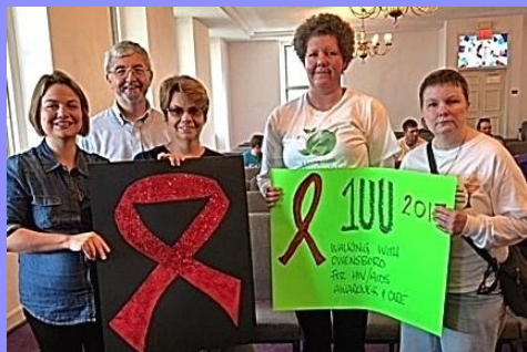
AIDS Walk 2017